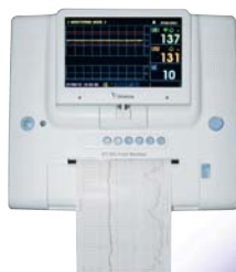
Wall mount style